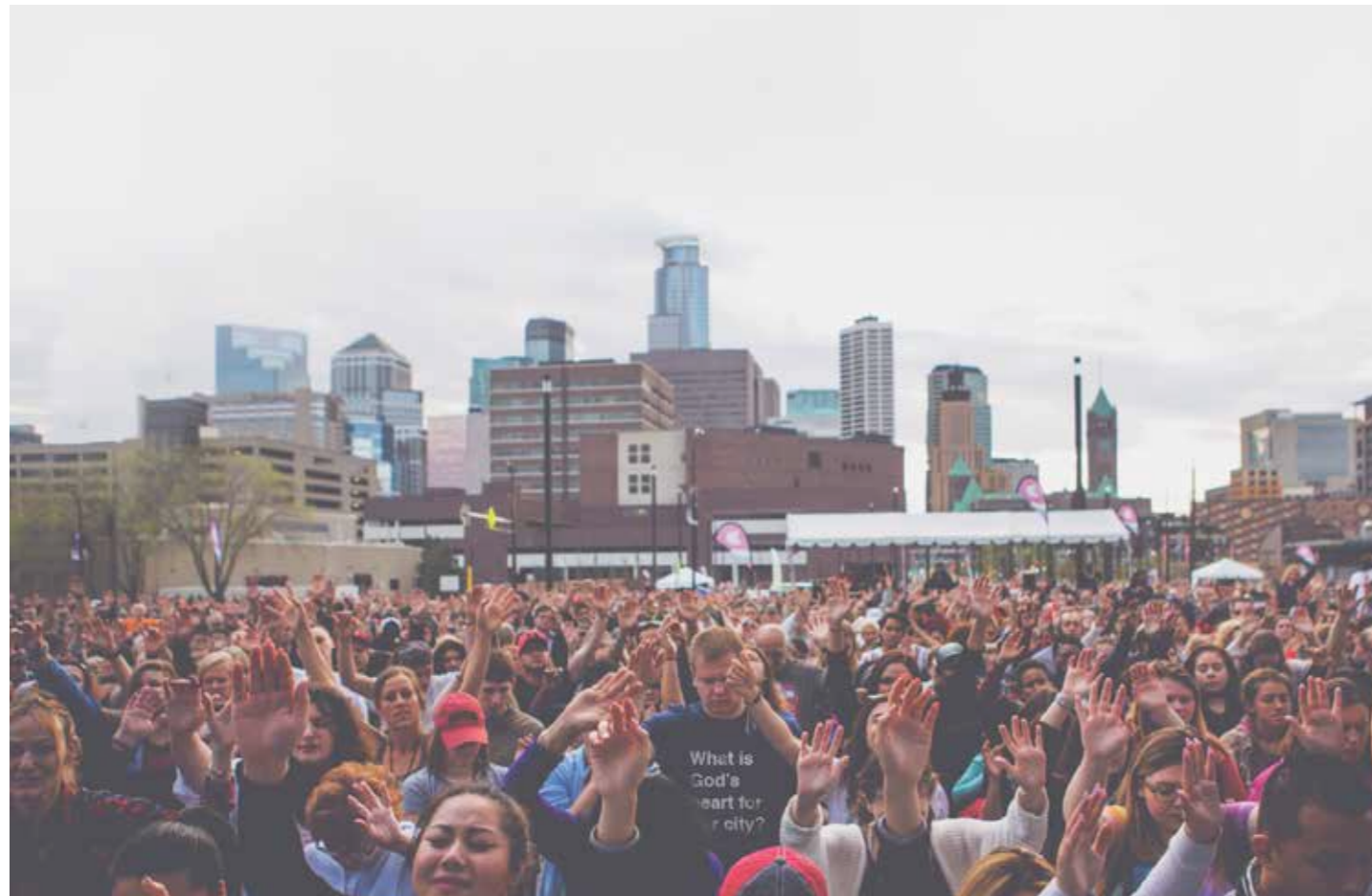
The Church of the Twin Cities is coming together for a season of catalytic outreach. May 18, 2018—the campaign culminates at U.S. Bank Stadium for an event that will reach tens of thousands of people who need to hear the message of Jesus.

Follow-up & Connecting People to Local Churches