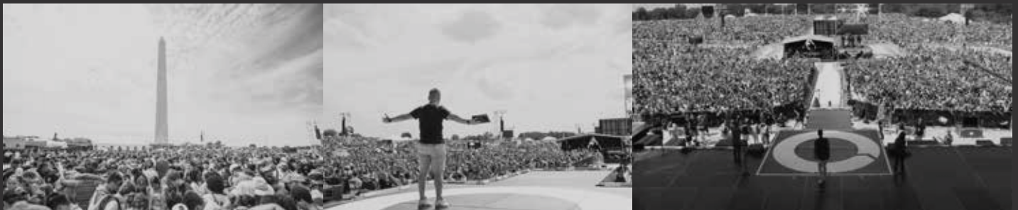
Hundreds of thousands gathering on the National Mall, July 16, 2016.